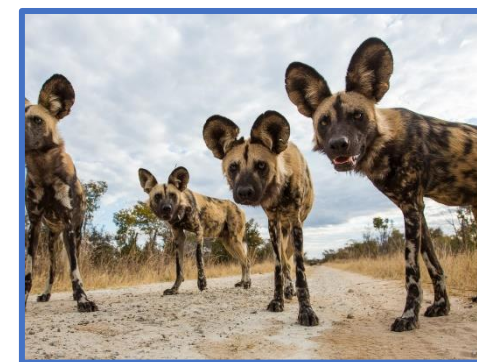
African Wild Painted Dogs

OKAVANGO DELTA, CHOBE NATIONAL PARK, SALT PANS & VICTORIA FALLS